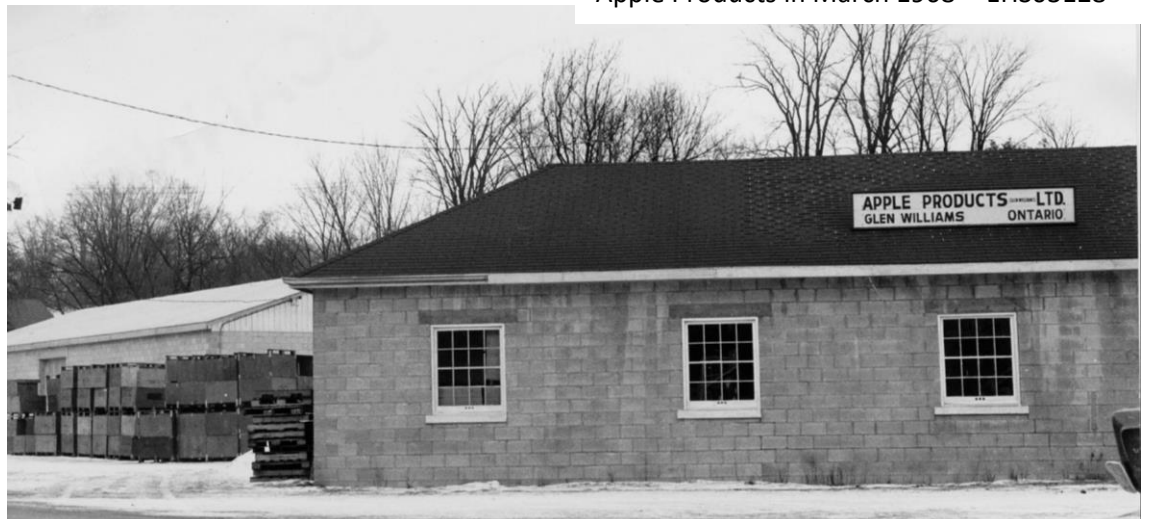
Apple Products in March 1968 EHS03128

This article was modified from the original which appeared in Neighbours in the Glen magazine in April 2015.