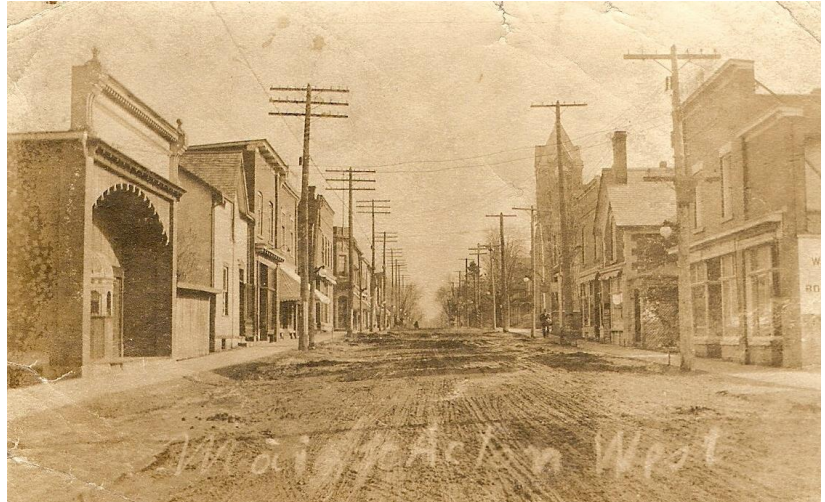
This photo of muddy Mill Street, Acton, shows the Wonderland Theatre on the left.