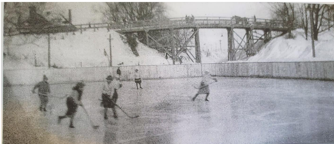
The renovated Beardmore Clubhouse at the foot of Frederick Street opened in December 1920 and this photo of the ice surface is from Vintage Acton . The Maria Street bridge is in the background.