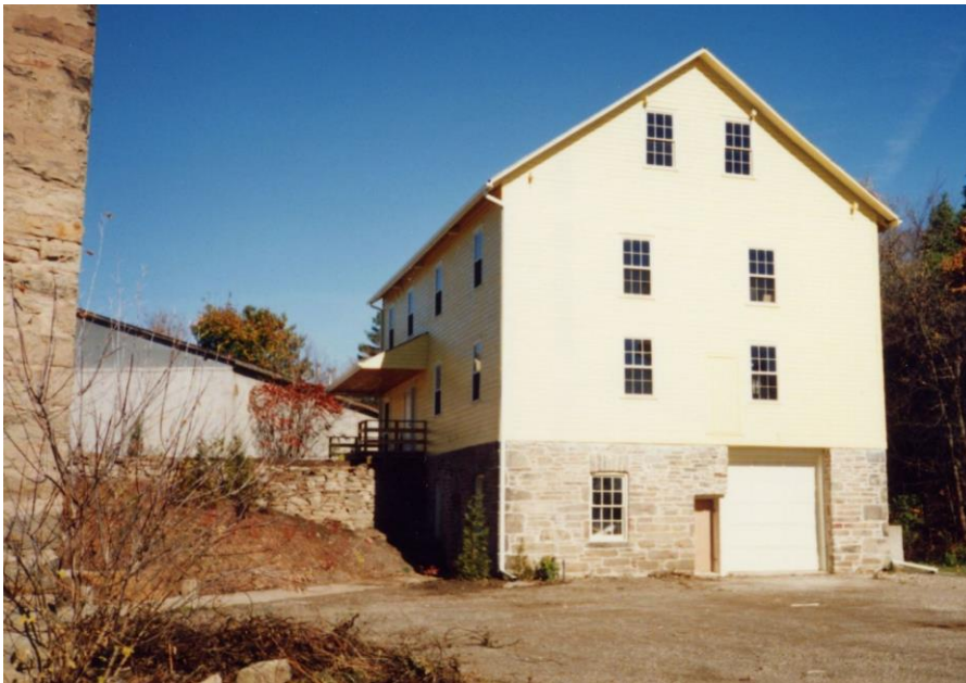
Former saw mill in October 1989. At centre is the former apple warehouse and on the left is the corner of the former hydro-electric plant. EHS00498

The stone building, yellow mill and lower parking lot of the Williams Mill property, October 2009.