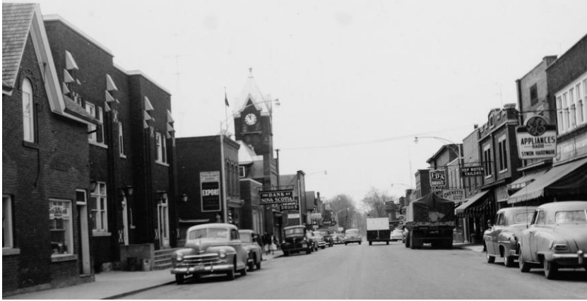
Mill Street, Acton about 1949