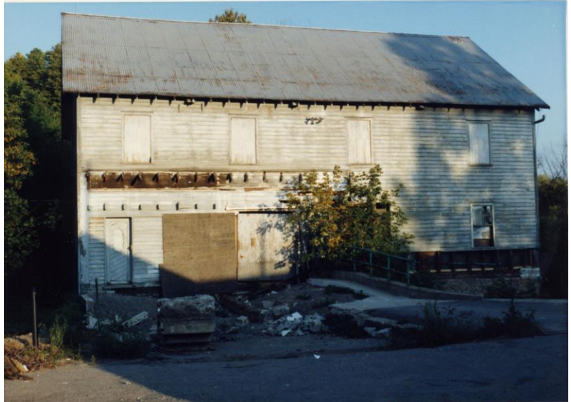
Former saw mill in June 1987. EHS10149

The video is on the “Let’s Talk Halton Hills” page of the website of the Town of Halton Hills. Select the “Heritage Planning” photo. Alternately, the video was posted to YouTube in Sept. 2021 under the title, “The Williams Mill Property.”