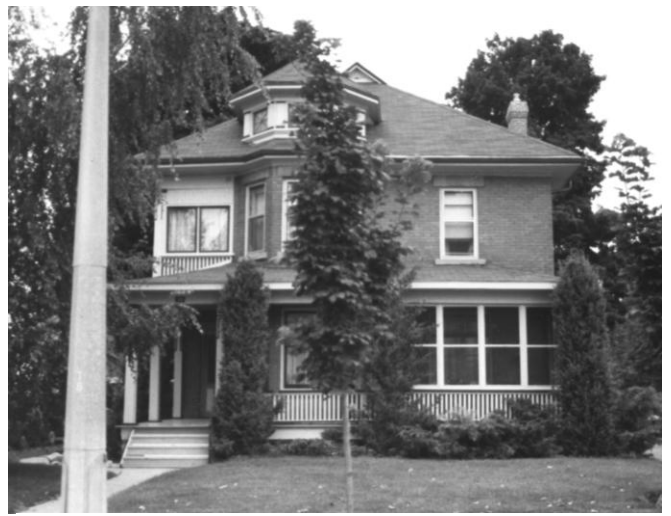
Clark House, 35 Bower St., Acton (1996) - EHS23635