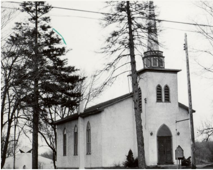
St. Paul's Anglican, 12-16 Adamson St. S., Norval (1973) EHS13500