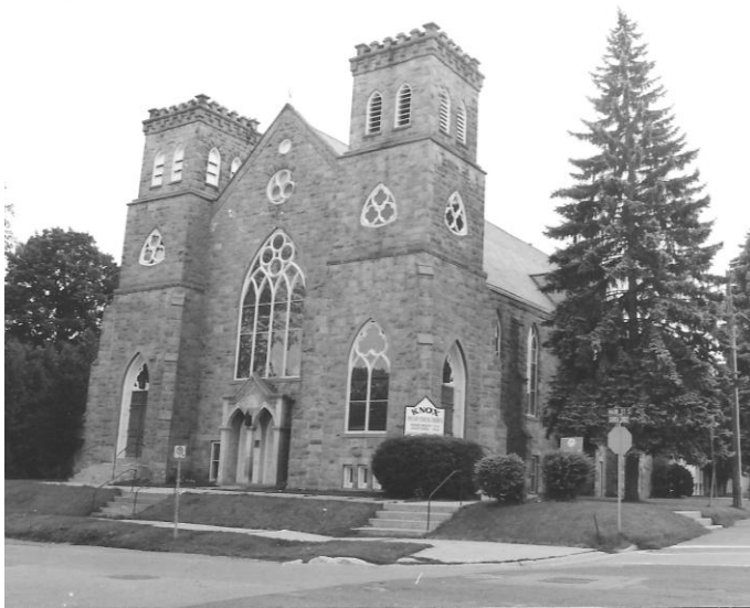
Knox Presbyterian Church, 116 Main St. S., Georgetown (1994) EHS10951