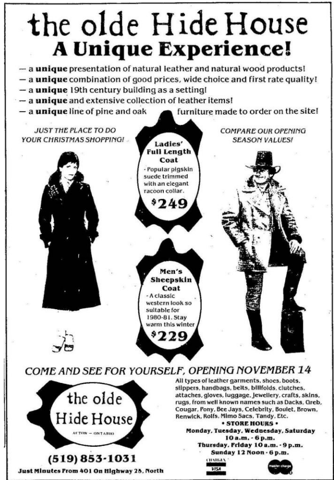
PHOTOS: Interior view in 2024 -Ray Denny Photo Jack Tanners Table EHS13030 Opening Advertisement -Acton Free Press, 14 Nov. 1980 BELOW: Exterior in 1994 EHS18491