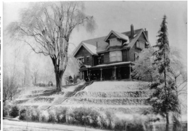
Barraclough House, 25 Mountain St., Glen Williams (c.1910) EHS00666

Currie Farm House 9156 Trafalgar Road, Ashgrove Bailey-Thompson House 50 Queen St., Georgetown Arnold House 91 Mill St., E., Acton Wright Family Home 14-16 Queen St., Georgetown UENI 22 Queen St., Georgetown ILLAHEE 24 Queen St., Georgetown