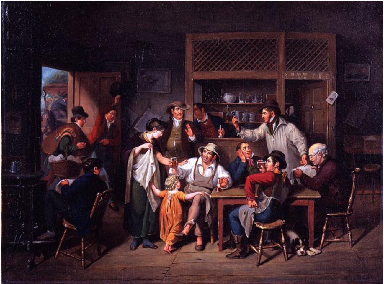
The Village Tavern by John Lewis Krimmel, 1815