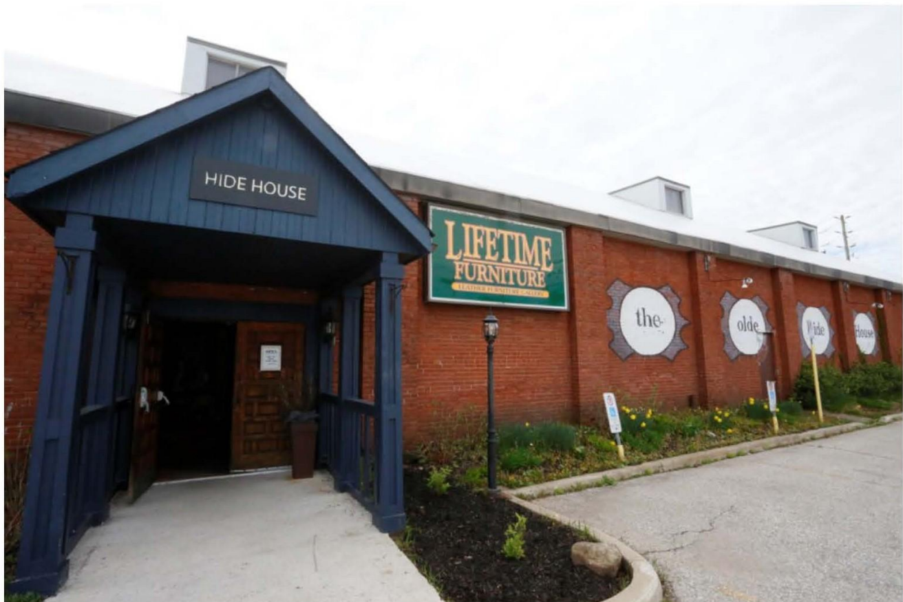
Exterior of the (Olde) Hide House.