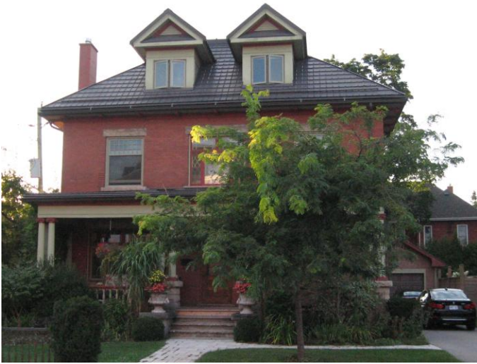
United Church Parsonage, 29 Bower St., Acton (2015) -EHS23029