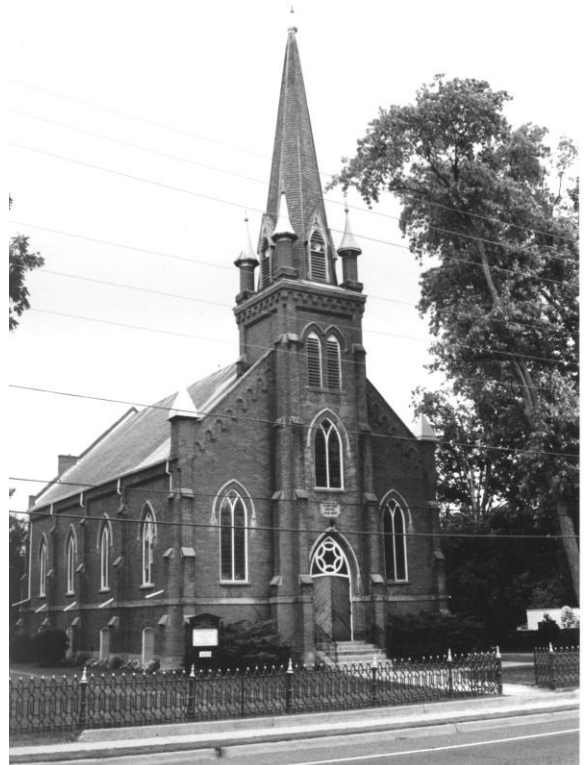
Norval Presbyterian Church, 499 Guelph St., Norval (1997) EHS23705