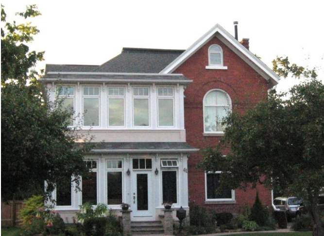
Henderson-Mason House, 41 Bower St., Acton (2015) -EHS23030