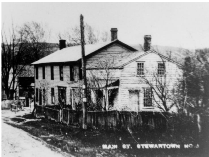
Stewarttown Hotel (detail of EHS00471)