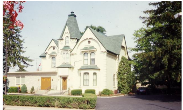
Sunderland Villa, 55 Mill St. E., Acton (1994) EHS18539