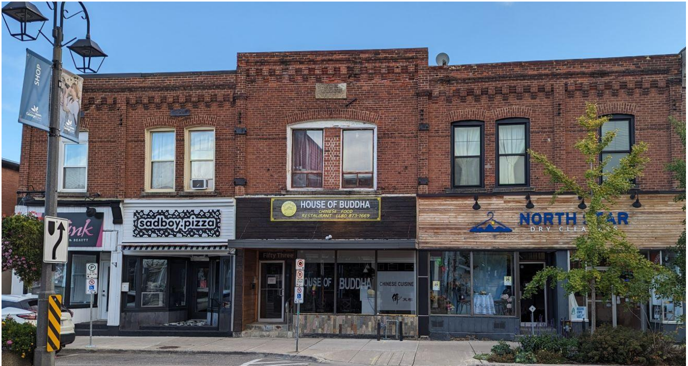
Roe Block, 19-57 Main St. S., Georgetown (2023)