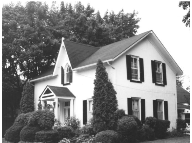
Noble House, 10 Noble St., Norval (1997) - EHS23852